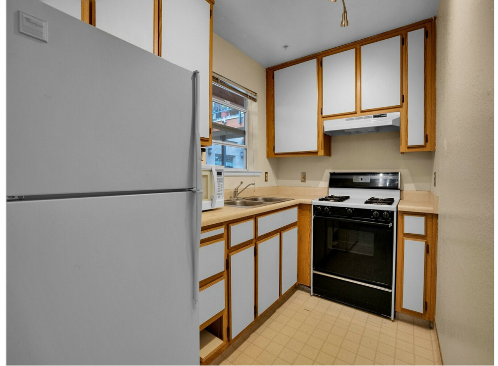
1114 -307 interior3