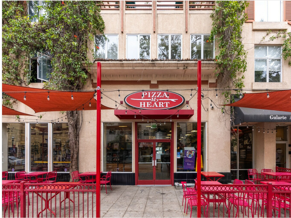
1114 front view of building2