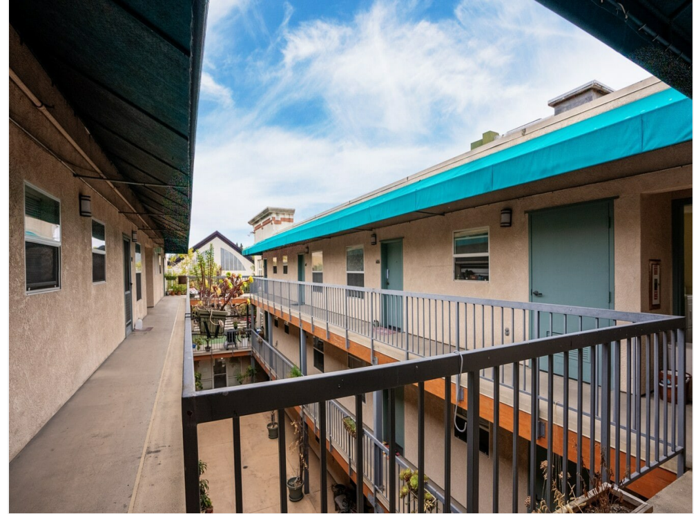
1114 courtyard 4th floor