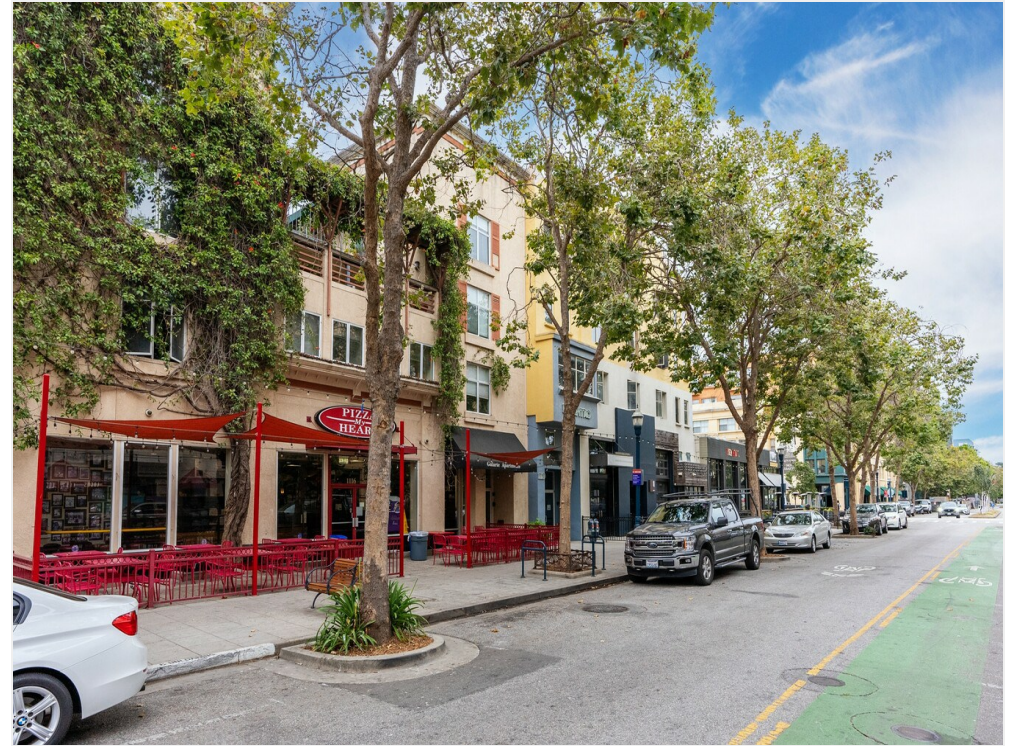
1114 street view