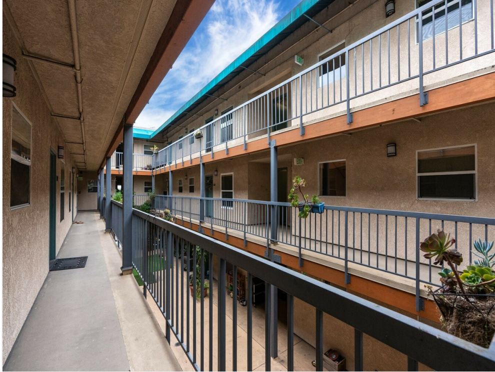
1114 courtyard 3rd floor